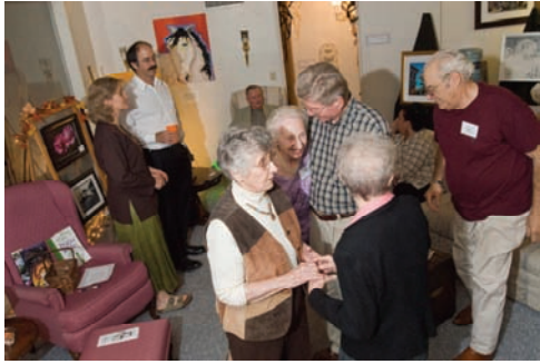
Timeless Art Show 2007