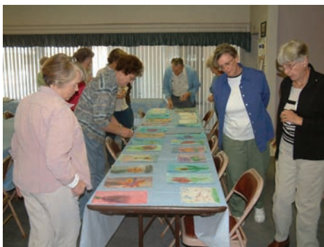
RBAA members judging last year's Tehama County Children's Autumn Art Contest entries. Over 230 entries were received from Tehama County school children ages K-12.

The RBAA celebrates 52 years of bringing art opportunities, education and enrichment to the North Valley. For more information call 527-4810 or write RBAA, Box 944, Red Bluff 96080