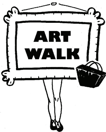
Art work by Christy Vail

Twenty four businesses and over 70 artists participated in the Tehama County Arts Council's 7th annual ArtWalk in downtown Red Bluff on November 6 and 7.