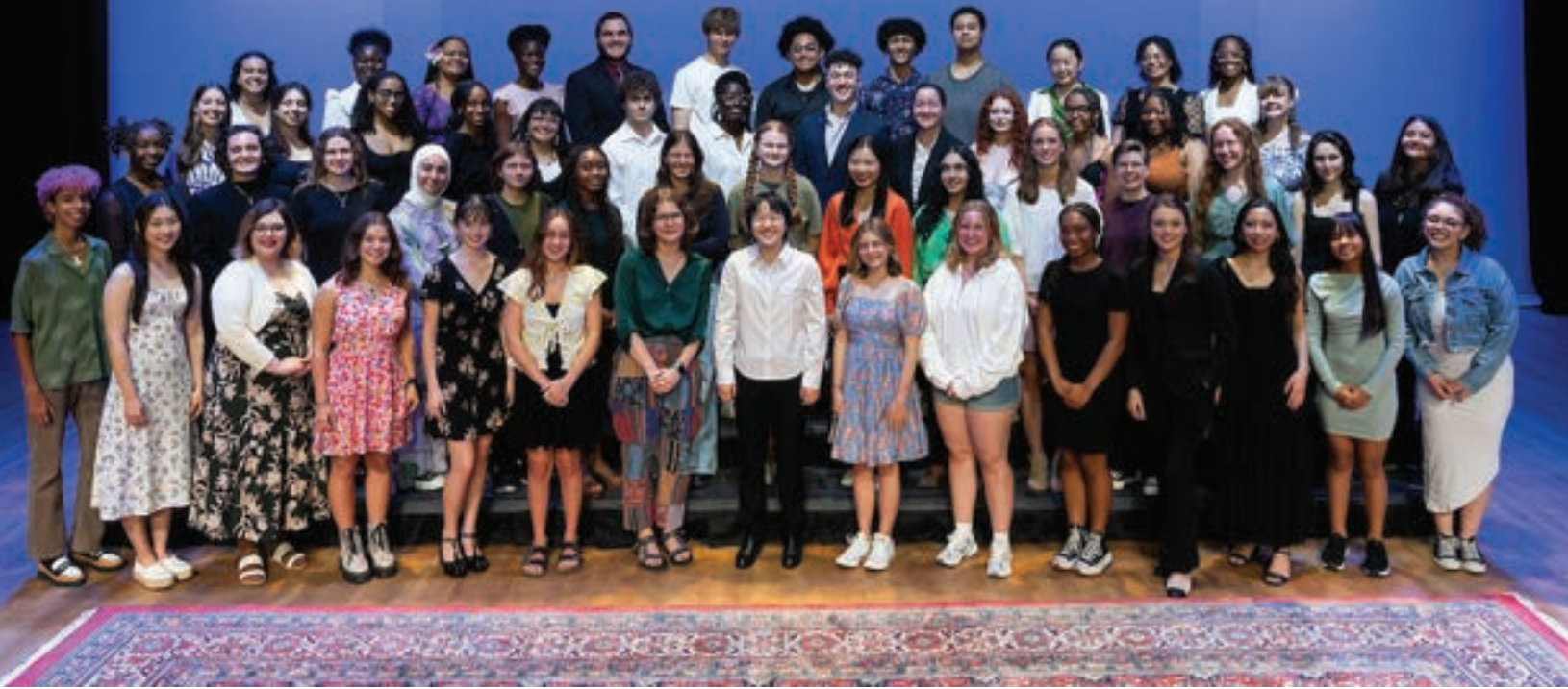
2024 State and Jurisdictional Champions

“Once I dove in and really started to understand the meaning of the poems, it was surprising how ‘alike’ we are throughout the ages. Love, war, nature, society...the poems may be in different times and places, but the emotions remain the same.”